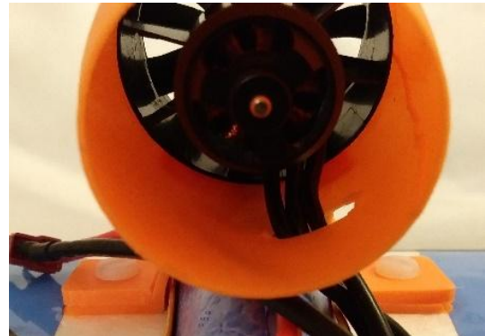
2.Power Wires Exit